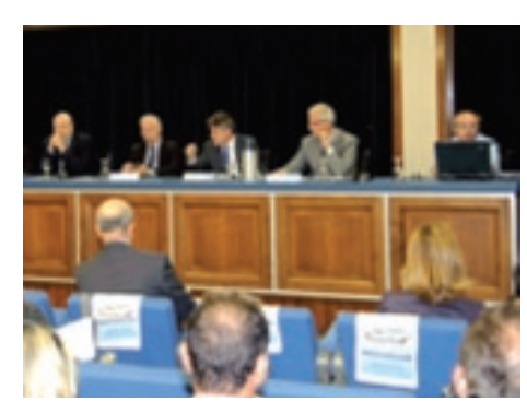
Conference on trade between Sicily and the UK

alongside day-to-day business operations without requiring a disproportionate amount of extra resources.